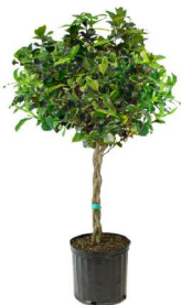
SHIPPED IN A 10-INCH POT. PLANT SIZE MAY VARY BASED ON GROWING CONDITIONS.

Note: Some leaves may appear wilted or yellow upon arrival. This is due to the stress of shipping and is nothing to worry about. Water the plant and let it recover in a shady location for a few days, then gently remove any foliage that does not recover to allow for new growth.